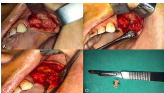
Figure 4. A. The rectangular bone window was removed with the help of piezo-surgery. B. The tooth root is removed through the intraoral access. C. L-PRF was applied to the surgery area. D. The removed bone piece was fixed with the aid of a mini screw.